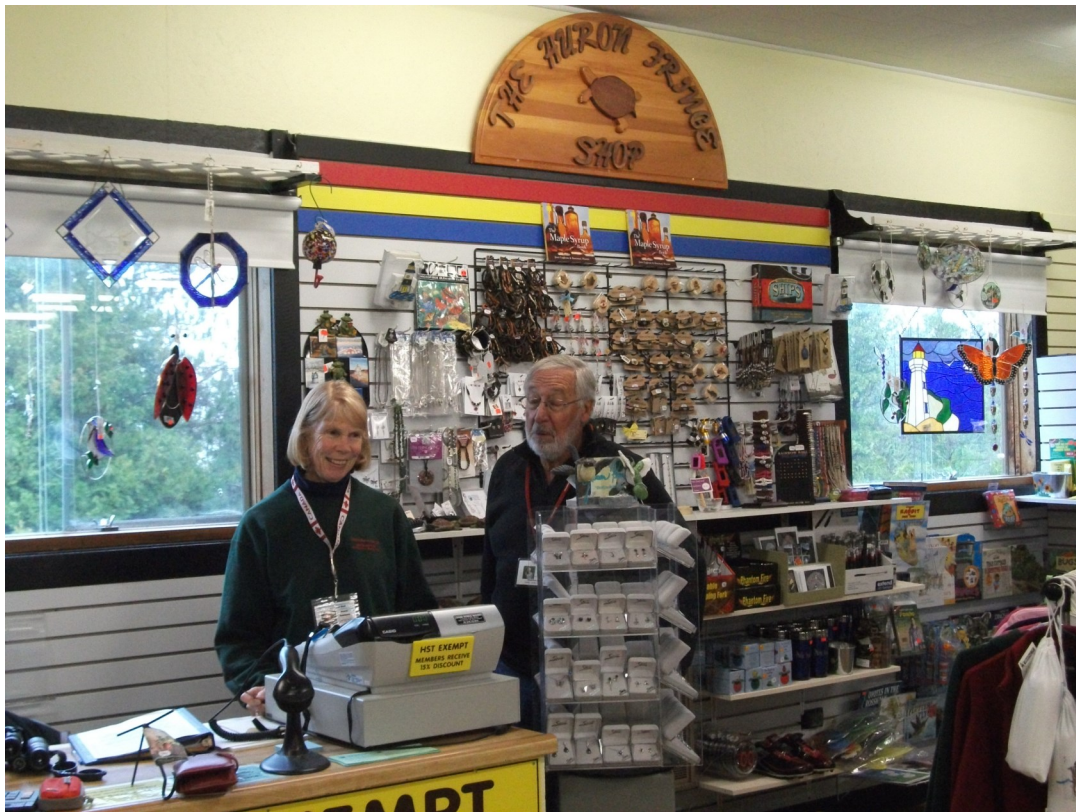
FRIENDS' VOLUNTEERS WORKING AT NEWLY DECORATED HURON FRINGE SHOP